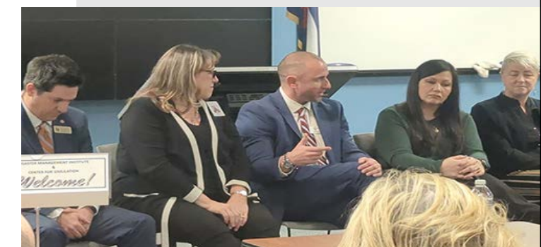
Education Panel Discussion