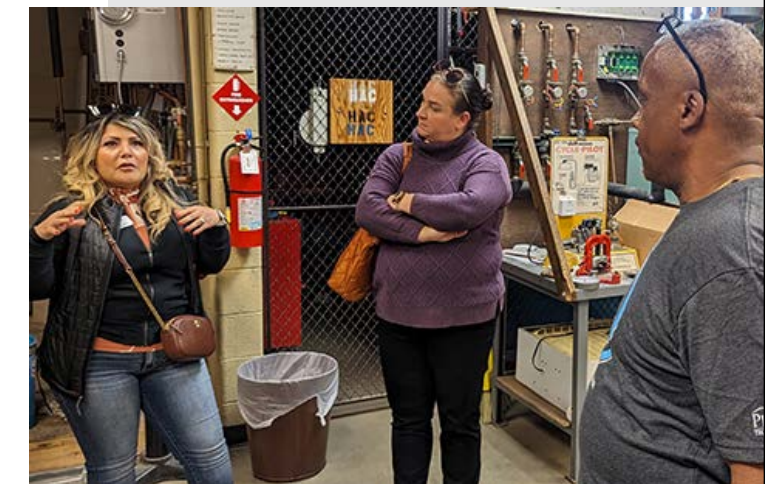
Above: Touring Pickens Technical College