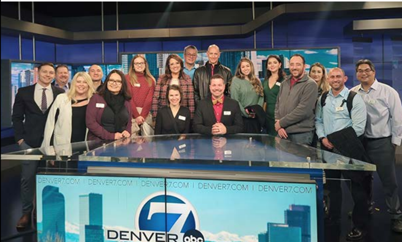
Above: Denver7 Newsroom