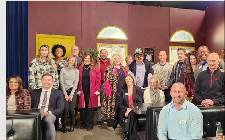
Happy Hour at Lowry Beer Garden