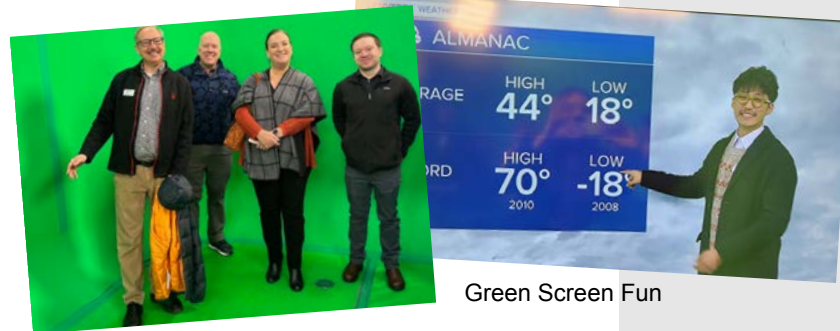
Green Screen Fun