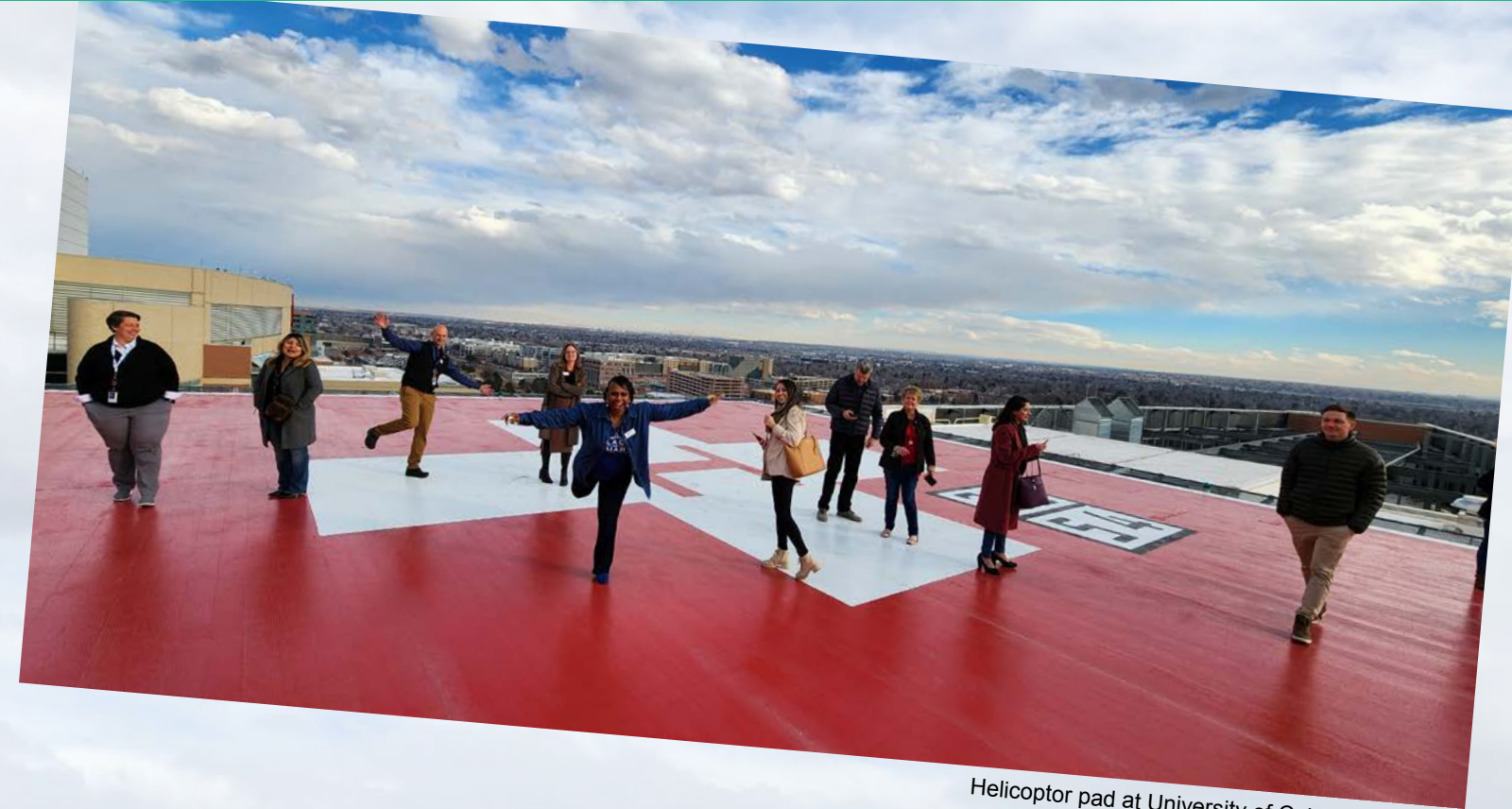
Helicopter pad at University of Colorado Hospital