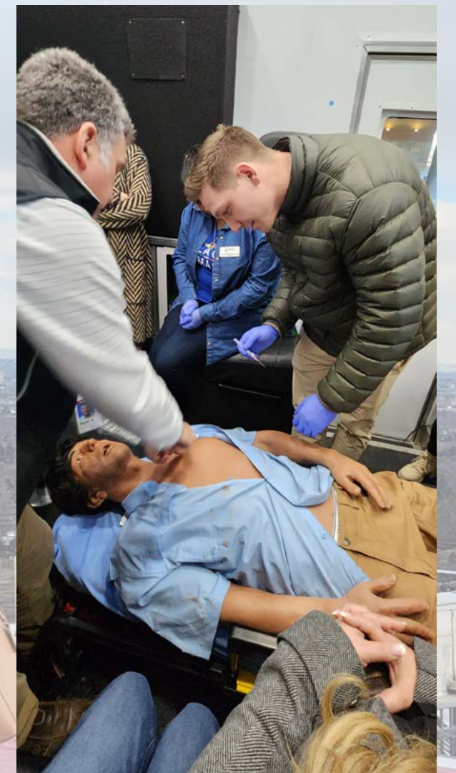
Simulation Lab at UC Health