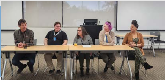
Left: Aurora Mental Health and Recovery Panel

As the “Best Class Ever” of the 2023-2024 Leadership Aurora program reaches our midpoint, Healthcare Day offered profound insights into how important our medical systems are and how the City of Aurora contains some of our country’s most advanced medical procedures and technologies making Healthcare Day, a truly unforgettable and enriching experience.