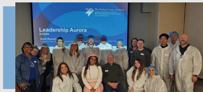
Medial Center of Aurora