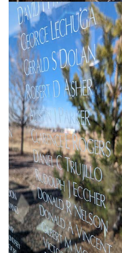
Above: Colorado Freedom Memorial